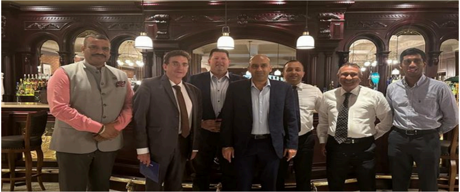
24th Annual General Meeting Of The Council For Business With Britain Of The Ceylon Chamber Of Commerce at the Westminster House, Vidya Mawatha, Colombo 07