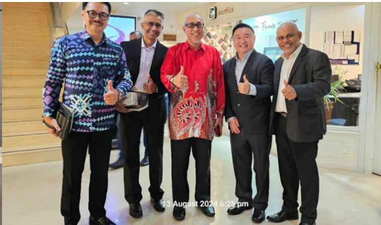
Apex Endeavour Sdn Bhd signed an exclusive Channel Management Agreement for distribution with Dankotuwa Porcelain PLC in Malaysia