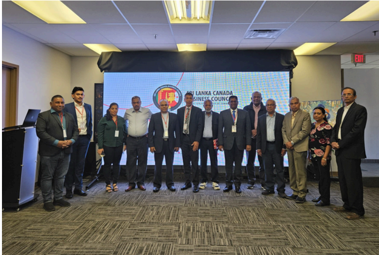
The Sri Lanka-Canada Business Council Delegation Meets with Global Affairs Canada to Enhance Bilateral Trade and Investment Opportunities