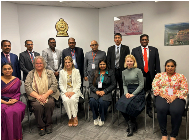
The Sri Lanka-Canada Business Council Delegation Meets with Global Affairs Canada to Enhance Bilateral Trade and Investment Opportunities