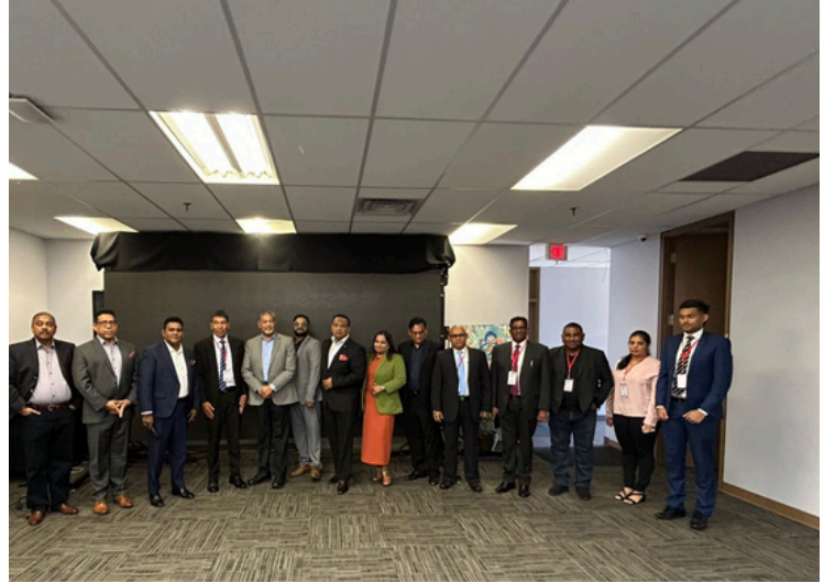
Sri Lanka-Canada Business Council Delegation Meets with Golden and Food Manufacturing Limited