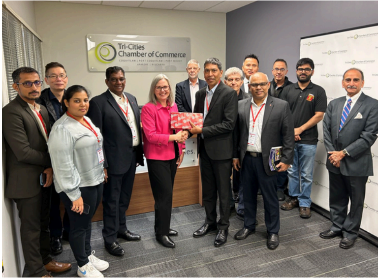
Sri Lanka-Canada Business Council Delegation Meets with Tri-Cities Chamber of Commerce