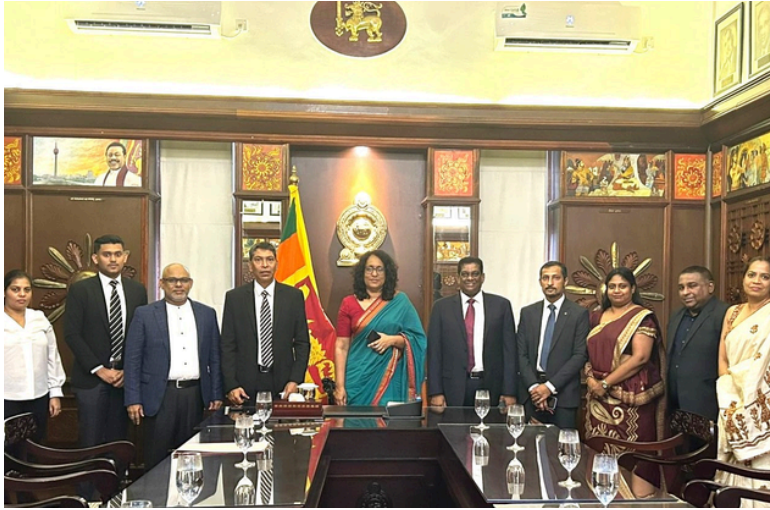
Successful Meeting between Sri Lanka-Canada Business Council and Can Lanka Business Association Members