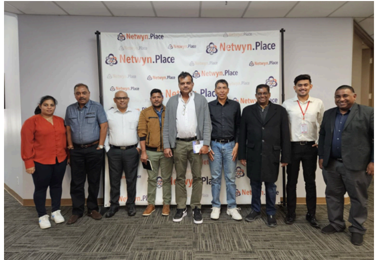
Sri Lanka-Canada Business Council Delegation Meets with Surrey Board of Trade